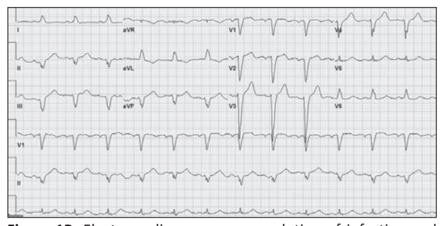
Figure 1B . Electrocardiogram upon resolution of infection and restored 1:1 AV conduction with old inferior myocardial infarction and left bundle branch block.

Due to hemodynamic collapse a temporary transvenous pacemaker was inserted and dopamine infusion started. Cardiac markers remained negative. On the following days he remained dependent of the pacemaker due to persistent AV block. A transthoracic echocardiogram was performed but the patient had a poor echocardiographic window that precluded an adequate structural and functional cardiac assessment. Finally, on the 8th day dopamine infusion stopped and he was successfully extubated but remained dependent of the temporary transcutaneous pacemaker. He resumed 1:1 AV conduction (figure 1B) on the 10th day and the transvenous pacemaker was removed. The patient was transferred to the medicine ward where he remained stable and successfully discharged home after 16 days of hospitalization.