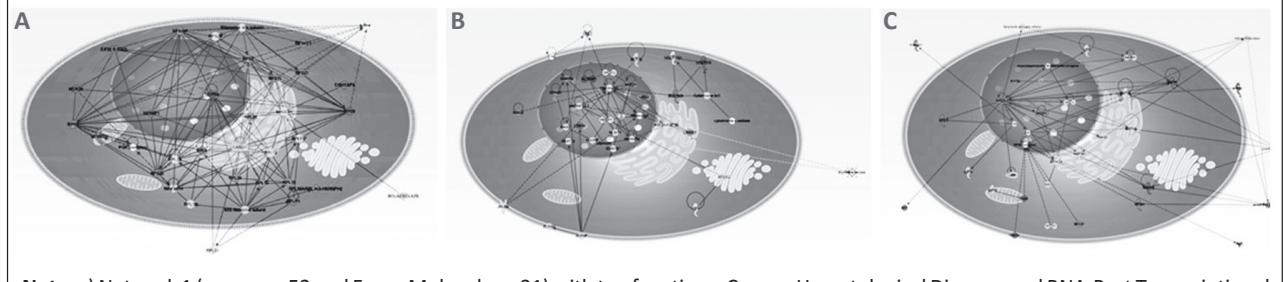
Note: a) Network 1 (p-score = 52 and Focus Molecules = 31) with top functions: Cancer, Hematological Disease, and RNA-Post Transcriptional Modifications; b) Network 2 (p-score = 44 and Focus Molecules = 28) with top functions: RNA Post-Transcriptional Modification, Infectious Disease, and Cancer; c) Network 3 (p-score = 42 and Focus Molecules = 27) with top functions: Drug Metabolism, Protein Synthesis, Glutathione Depletion in Liver.