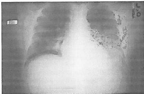
Figure 1B. Follow-up chest radiograph shows worsening of the left lower lobe infiltrate as assessed by further lobe consolidation and development of a small pleural effusion.

He was admitted with the diagnosis of left lower lobe pneumonia and started on ceftriaxone (Rocephin®) 1 gm IV daily and erythromycin 500 mg IV every six hours. Despite treatment, the patient's clinical condition deteriorated, dyspnea and hypoxemia increased. Chest radiograph showed progression of the left lower lobe infiltrate with alveolar consolidation and small left pleural effusion (Fig. 1B). On the 5th hospital day the patient