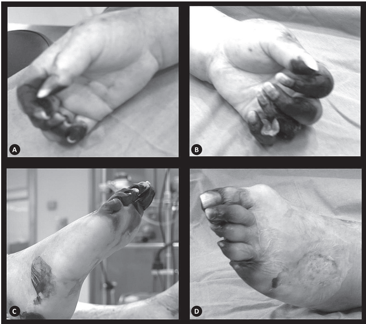
Figure 1. A. Necrotic lesions presented in all the digits of the right hand. B. Extensive necrotic lesions on the left hand. C. Necrotic lesions affecting the ankle, sole, and toes of the right foot. D. Necrosis lesion located on the left foot.

Neisseria meningitidis contains a polysaccharide capsule, which protects meningococci against the host immune system and from serum bactericidal activity. However, Neisseria meningitidis also expresses long filamentous appendages, called type IV pili, on its surface. In contrast, microvascular