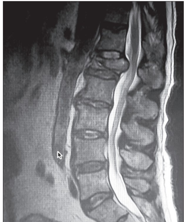
Figure 1. L1 thoracolumbar burst fracture with retropulsion and spinal cord compression.

laminectomy is performed at the level of the fracture and 1 level above. The inferior articular process of the level above the fracture is resected along with the superior and inferior articular processes, pars interarticularis, and pedicles of the affected level. This permits adequate visualization of the disc spaces and the exiting nerve roots. Radical discectomies are performed and the endplates are prepared for graft placement. Before starting the corpectomy, a temporary rod is placed contralateral to the side on which the corpectomy is to be performed to prevent translation of the vertebral column and cord compression.