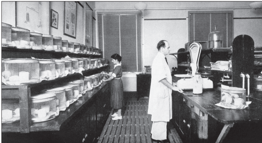
Vitamin Assay Laboratory , report of the Director 1938 (colu_0037). Archives and Special Collections at the Augustus C. Long Health Sciences Library of Columbia University, School of Tropical Medicine under the Auspices of Columbia University, Annual Reports of the Director.

health discipline traversed an academic path from an oblique or cryptic organizational presence into a full visible and esteemed academic department. However, as we have already seen, the field of public health had since the beginnings a discernible educational and conceptual framework that permeated the whole institutional climate of the School, while also receiving strong organizational support from the insular HD (58). This major departmental innovation foreshadowed a future significant educational transformation of the STM. From being a non degree-granting postgraduate school of tropical medicine (that offered certificates and advanced credits in tropical medicine), the educational branch of the School gradually would become a predominant public health personnel-training site at the master degree level (i.e., MS in Public Health, Sanitary Sciences, and Public Health Engineering) and reoriented its offer of short courses (i.e., sanitary inspectors) and certificates (i.e., public health practice, public health nursing, and medical technology) (59). Nevertheless, hospital services, and basic and clinical research on tropical diseases and other medical conditions, as well as research on public health issues and community field studies would continue unabated until the closure of the School.