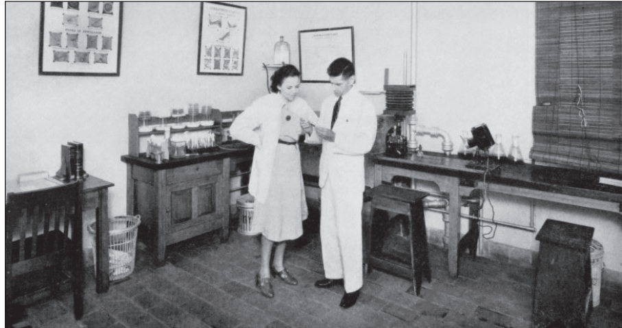
Figure 1. Department of Mycology and Dermatology. Archives and Special Collections at the Augustus C. Long Health Sciences Library of Columbia University, School of Tropical Medicine under the Auspices of Columbia University, Report of the Director 1938.

During the years of this last era other epistemological assemblages of research topics were added as reconceptualization of previous particular studies: a) the already mentioned studies on murine typhus of rats in San Juan; b) studies of enteric bacteriology (diarrhea and intestinal infections) of the salmonella group (food poisoning) and shigellosis infections; and c) another variation of enteric studies, under the label of typhoid fever, a bacterial infection also due to Salmonella typhi