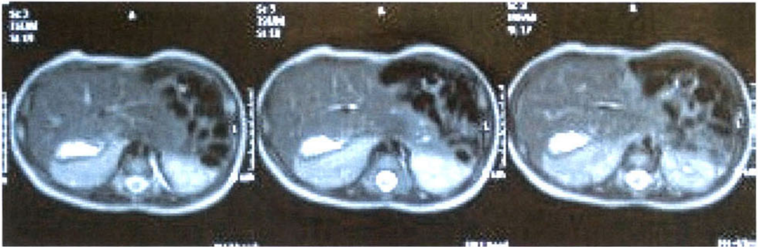
Figure 3: CT-Scan Showing Liver, Stomach and Spleen located on the Right Side of the Abdomen.

abdomen. The colon was situated on the right side of the abdomen, but it was not well delineated. Progress of the meal was normal and without evidence of obstruction. Computed tomography with intravenous and oral contrast (Figure 3) revealed that the liver, stomach and spleen were located on the right side of the abdomen and left sided small intestine. There was no evidence of heart disease. Radiological findings are those of abdominal situs inversus with levocardia and intestinal malrotation.